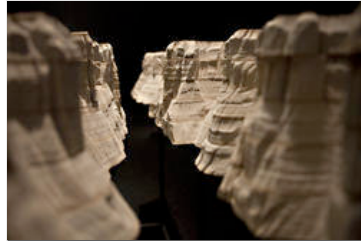
What we've pulped: Laramée's canyon. Braden Van Drag

The book, we keep hearing, is on its way out. Whether it's the fault of Kindle or the Web itself, we will, we're told, read differently in the future. The Book Borrowers: Contemporary Artists Transforming the Book, a show organized by the Bellevue Arts Museum, is less about reading books and more about reading into them; less about their contents and more about their usefulness as media. Books, after all, make good raw materials: Paper and cardboard are malleable, their pages take color well, and the patterns and repetitions in found text and imagery offer a rich vein to mine. Paper also straddles the line between art and craft nicely in this show, which features 13 local and international artists.